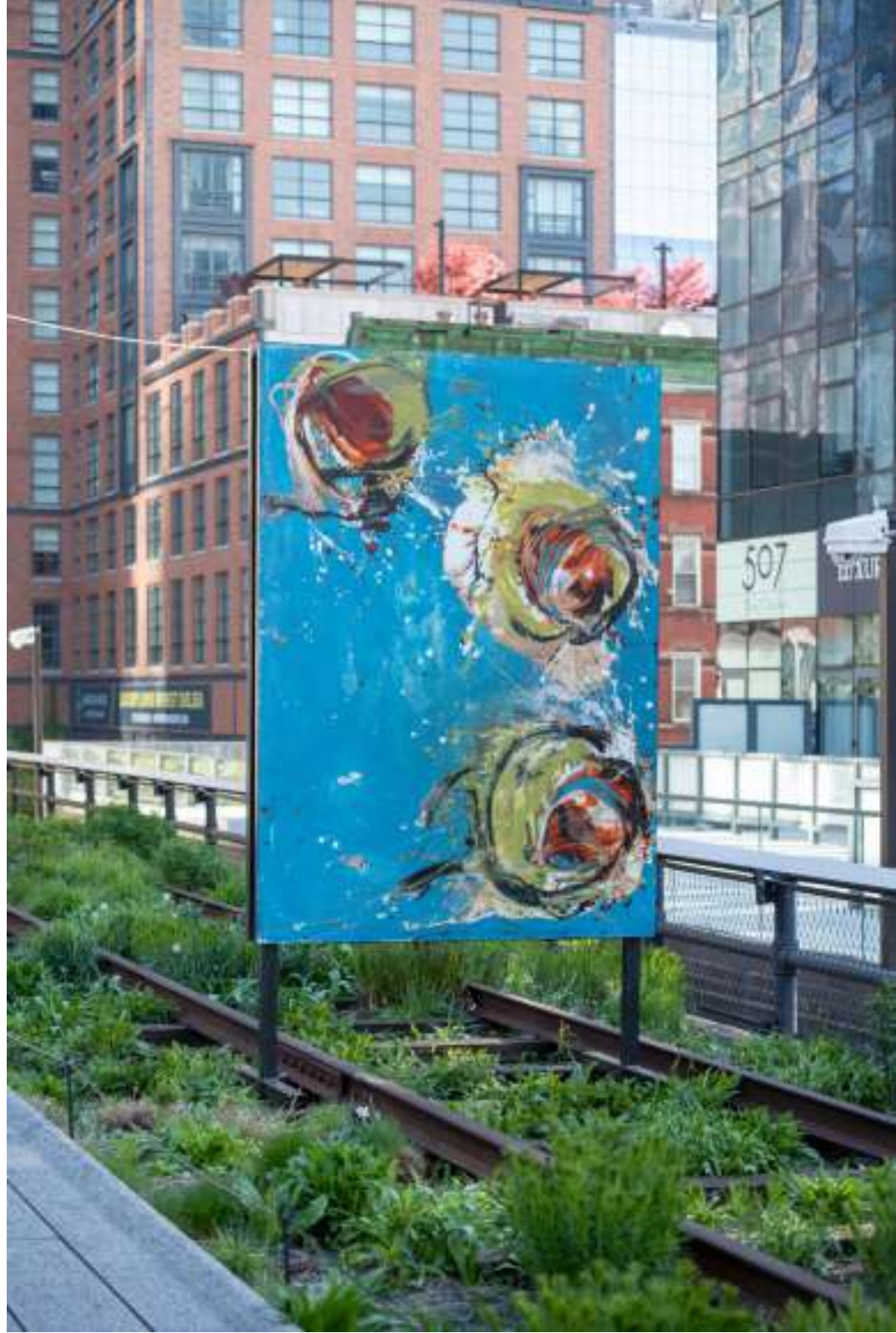
Installation view The High Line, New York, 2019