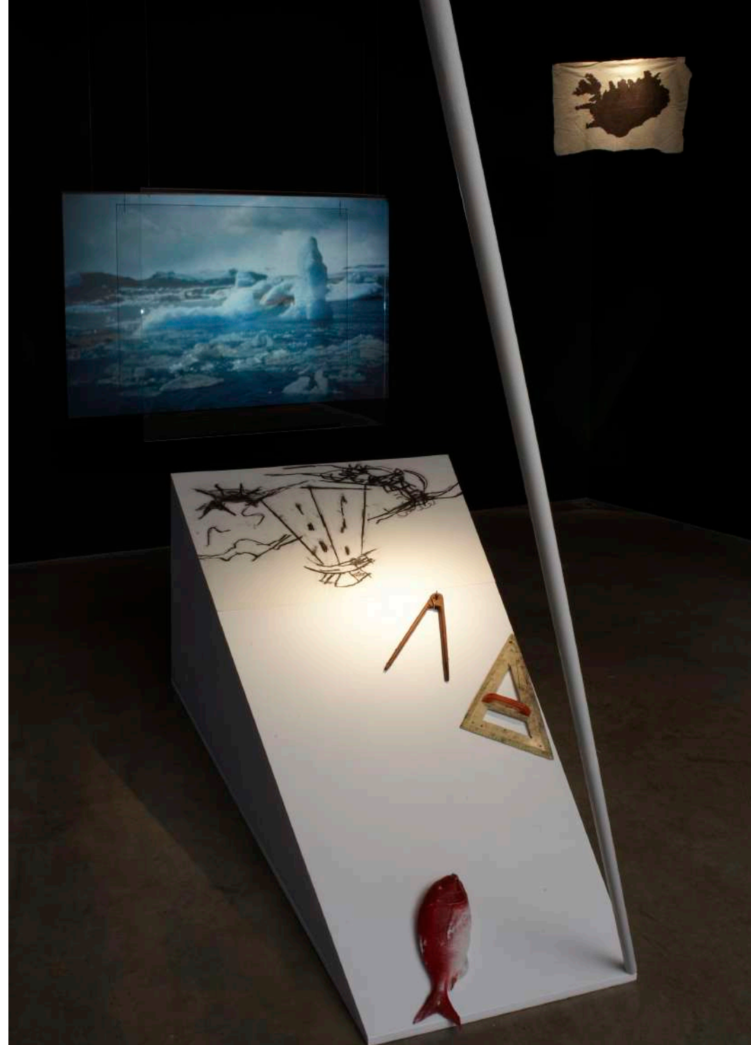
Installation view Volcano Saga (1985/1994/2011), Wilkinson Gallery, London, 2011.

–Joan Jonas in Joan Jonas: Performance Video Installation , Hatje Cantz Verlag, 2001