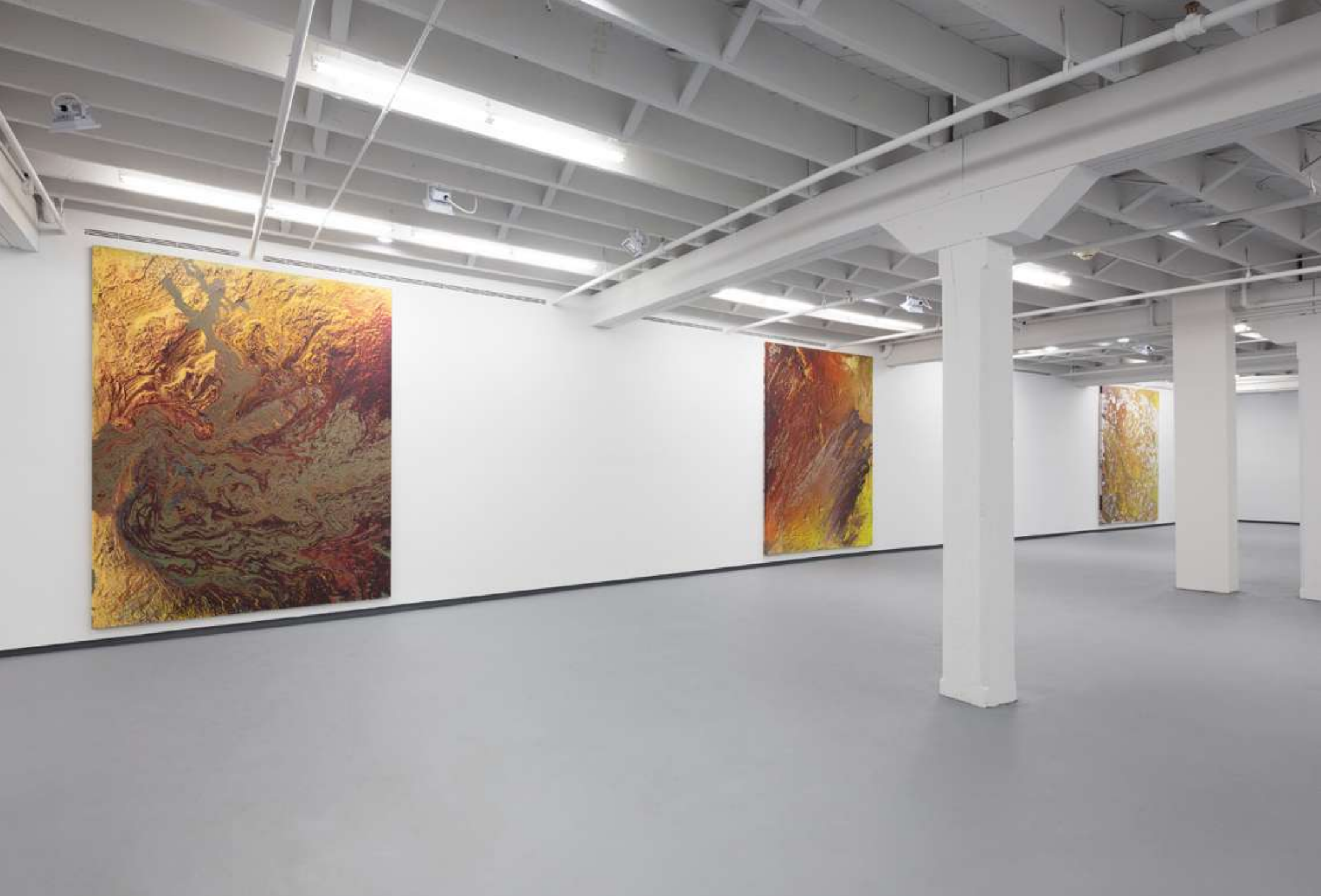
Installation view ICA Institute of Contemporary Art, Miami, 2015